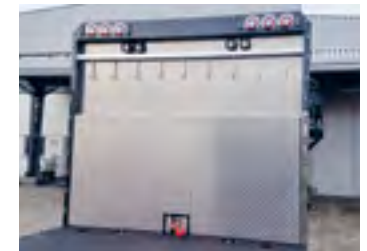
Rear wall made of ribbed sheet metal, matching the vehicle's height