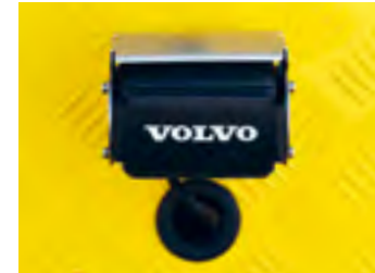
Wiring and installation for the rearview camera