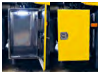
Cabinets for tools or work clothes, in your choice of colour