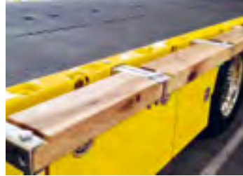
Manual extension of the platform with wood, extending up to 3 meters