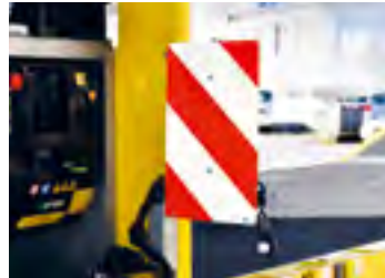
Illuminated oversize load signs