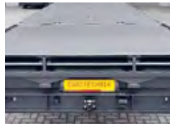
Trailer hitch on the rear ramp (3.5 tons)