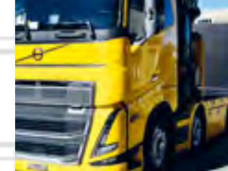
Painting of the truck frame and chassis