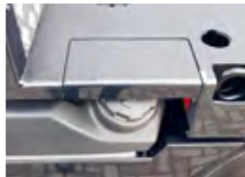
Flap for optimal access to the fuel cap