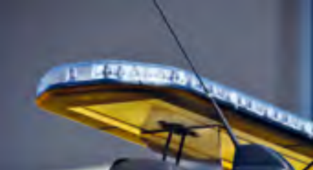
LED light bar mounted on the roof (Muntermann)