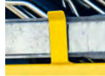
Support on the rear wall for a rescue traverse or stanchions