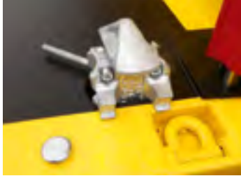
Twistlock for container to be fixed on the platform