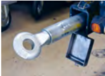
Towing hook for truck