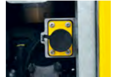
External start system 12/24 V including holder