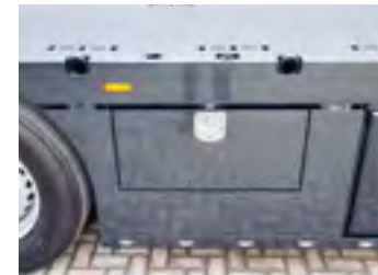
Side underrun protection with lighting