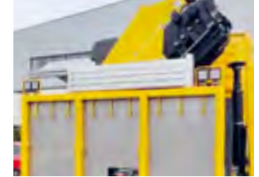
Stanchions on the rear wall, 4 pieces