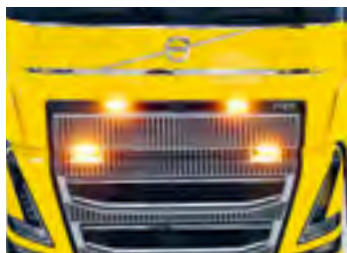
Beacons installed on the rear wall, at the rear, on the ramp, and at the front