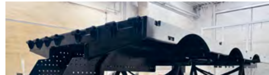
Corrosion protection: e-coating for the chassis Hot-dip galvanization is not feasible due to chassis deformation